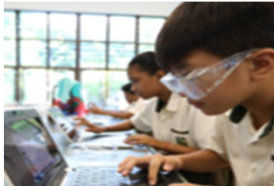
Support Self-Directed and Collaborative Learning