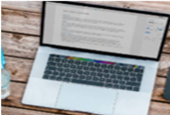
Support the Development of Digital Literacy

The use of the PLD for teaching and learning aims to: