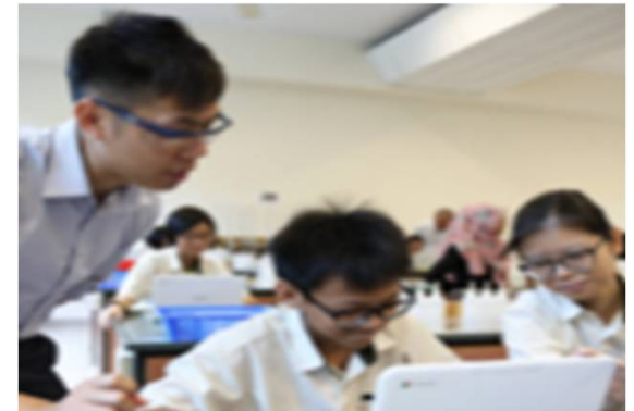
Enhance Teaching and Learning